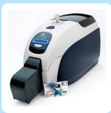
PVC card printers