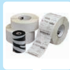
Consumables (labels, ribbons, PVC cards)