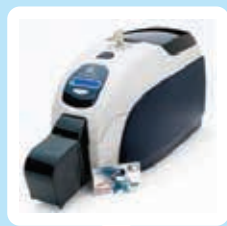
PVC card printers