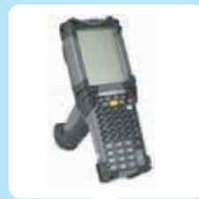
Data terminals & PDA